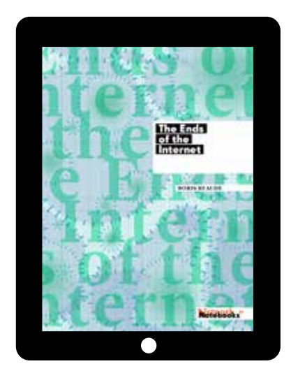
Download the EPUB edition of The Ends of the Internet directly from bit.ly/TheEndsoftheInternet

INC publication series include essay collections, commissioned writings, translations and longreads, all published online and freely downloadable. Experiments with multiple formats, such as PDF, EPUB and HTML push new developments in reading and publishing, while offering high quality content and design at the same time.