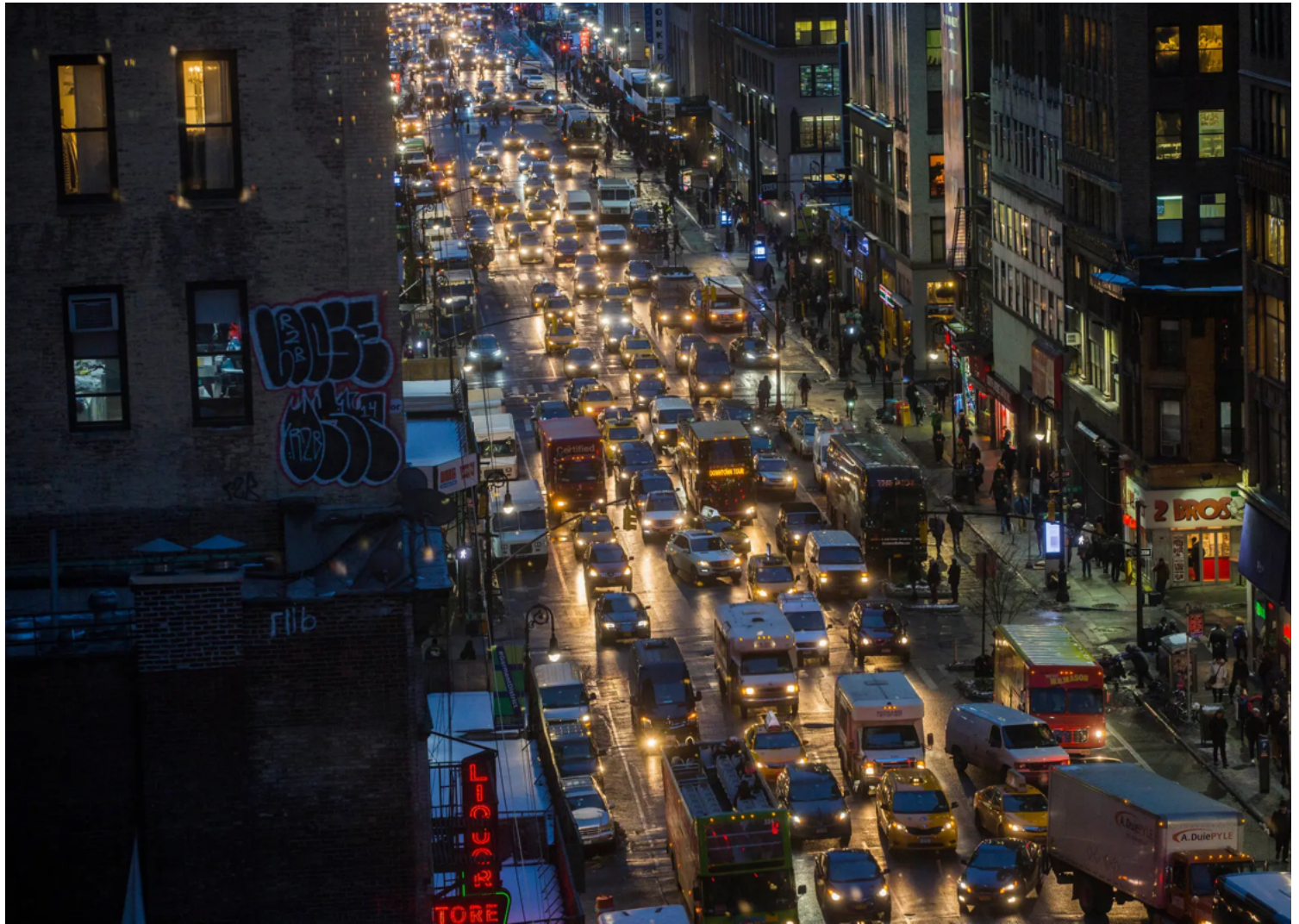
When Mayor Bill de Blasio tried to cap the number of Uber cars in New York, the company campaigned hard against the measure.