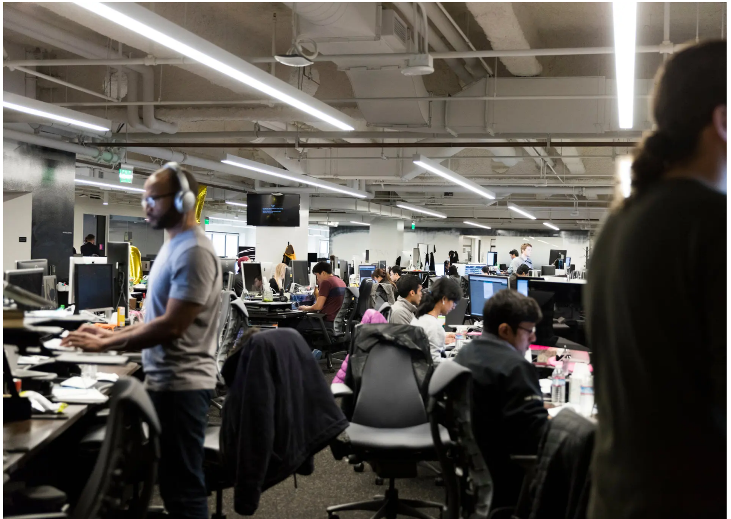
Uber headquarters in San Francisco. The company has grown fast, spreading to more than 70 countries and gaining a valuation of nearly $70 billion.

"Travis's biggest strength is that he will run through a wall to accomplish his goals," said Mark Cuban, the Dallas Mavericks owner and billionaire investor who has mentored Mr. Kalanick. "Travis's biggest weakness is that he will run through a wall to accomplish his goals. That's the best way to describe him."